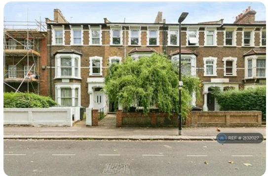
Mum's childhood home in London